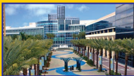
Both hotels are adjacent to the Anaheim Convention Center