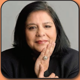
Consuelo Castillo Kickbusch