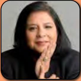
Consuelo Castillo Kickbusch