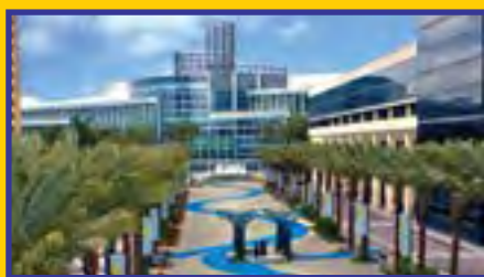
Both hotels are adjacent to the Anaheim Convention Center