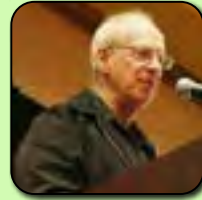
Dr. Stephen Krashen